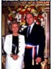
Elected Mayor of Paris