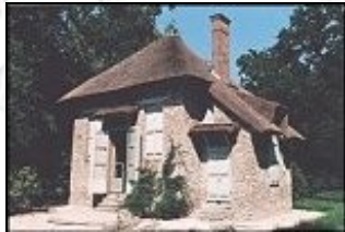
The Sea Shell Thatched Cottage