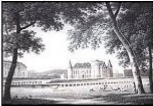
View and ancient plan of the Château