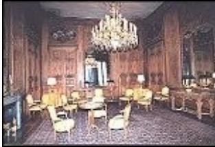
The Grand Lounge