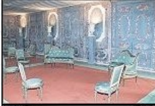
The Marble Room