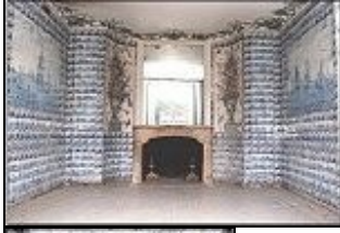
The Count of Toulouse bathroom