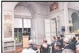
Opening of the Kosovo peace conference on 6 February 1999 (Dining room of the Chateau)