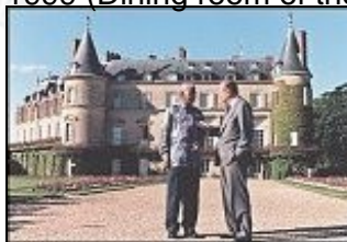
Mr. Nelson Mandela President of the Republic of South Africa's visit on 13 July 1996 (Chateau park)