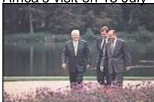
State visit of Mr. and Mrs. Boris Yeltsin on 20 October 1995 (Chateau park)