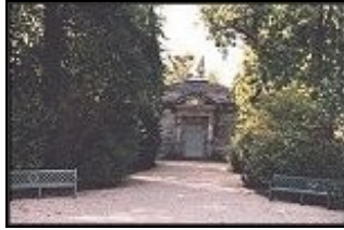
The Queen's dairy