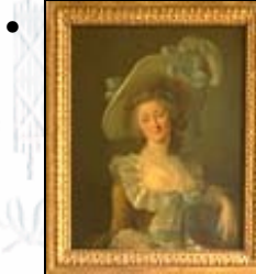
Portrait by Dessange