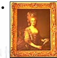
Marie-AmØlie of Parma

This salon has retained most of the structure of the decorations executed in the 18th century for the financier Nicolas Beaujon.