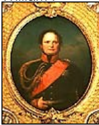
Tsar Nicolas I